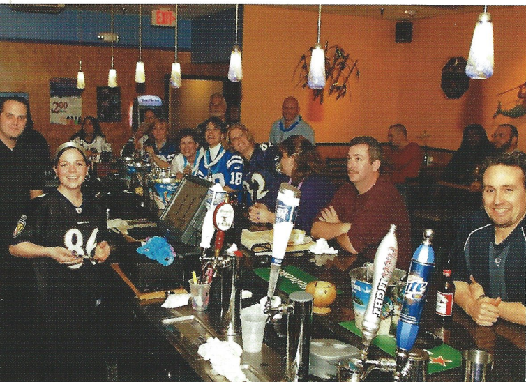
Fin’s Hawaiian Fusion and Sushi Bar Trivia night.

where it [business] was busy...It worked better than we ever thought.”