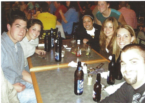
Trivia Maryland Team Suburbia