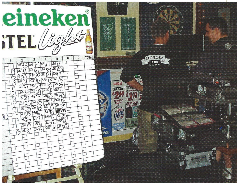
Heroes Pub Trivia night.